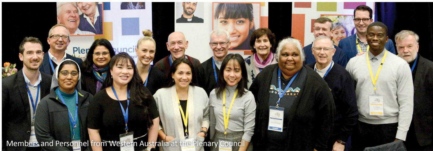
Members and Personnel from Western Australia at the Plenary Council